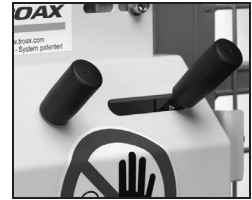
Ergonomically designed handles for easy use.