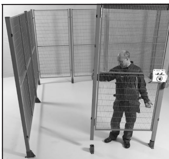
Pre-assembled doors complete with a Troax Safe Lock make for quick installation.

Doors are equipped with a Troax Safe Lock: Safe Lock 3 and 4-state category II. The category II can easily be upgraded to category IV.