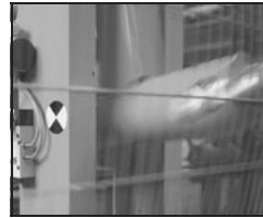
The Rapid Fix system meets European Machine Directives.