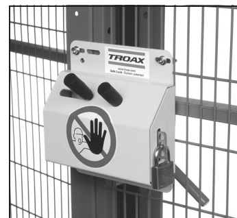
Troax Safe Lock is available in different security categories. See Safe Lock leaflet for details.