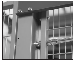
The door is delivered with bushings which are detached before installation.