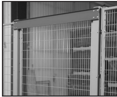
The door posts are made of sturdy profiles, which can withstand a considerable strain.